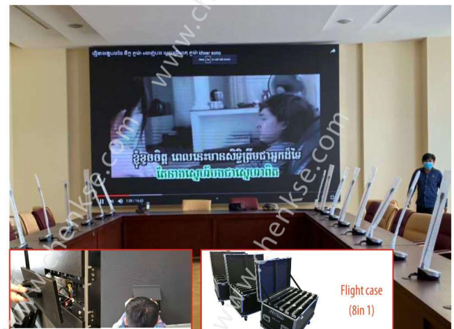
Front Maintenance service