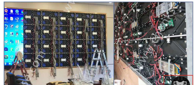
▲ Connecting plate Seamless Design